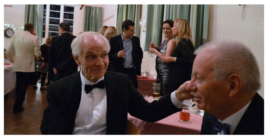
Cocktails & Canapes Dec 2013

Tickets, which cost £12.50 per person, need to be ordered and paid for in advance as this is always a sell-out. They are available from Tricia Harbour on 680676.